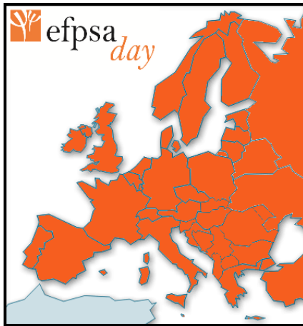
EFPSA day all around Europe

The second EFPSA Day in the history of EFPSA took place on November 15 th , 2011. Local Organisers (LO's) in many different countries across Europe had one common goal: present EFPSA to psychology students and spread the EFPSA spirit! This great event was organised at 51 universities across 25 countries on the same day! The number of countries organising this unique event means that most parts of Europe were covered - largely thanks to our wonderful LO's, who put a lot of effort into giving lectures, holding workshops and various presentations and sharing flyers regarding EFPSAs' activities and services among students at their universities. Some organisers even