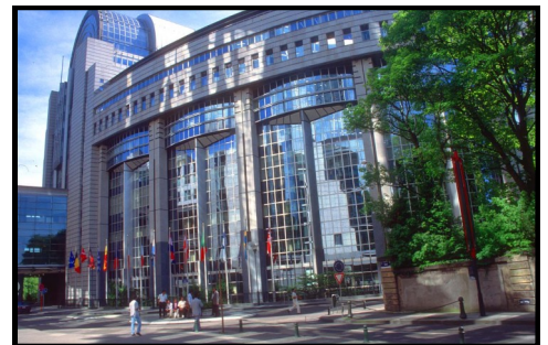
European Parliament (09.11. 2011)

The European Federation of Psychology Students' Associations (EFPSA) unites 29 psychology students' organisations all over Europe under one multicultural and colourful roof. It was established in 1987 during the first International Congress of Psychology Students in Portugal. Today EFPSA is a youth non-governmental organisation currently representing 250,000 psychology students from across Europe.