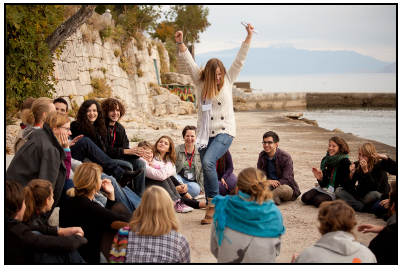
Participants of the EB/MR meeting 2011, Crikvenica, Croatia.

Alongside this, all teams had the opportunity to exchange experiences by presenting their working plans and future tasks to all Member Representatives present at the meeting. Last but not least, during the General Assembly MRs voted upon the approval of the new European Summer School event coordinator, whilst new and potential projects were also presented to the organization. Alongside the